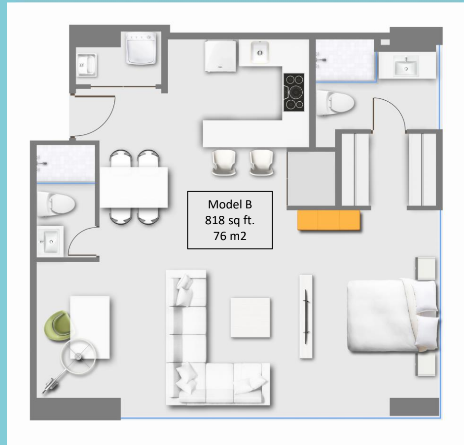
Apartments #6 and #7.