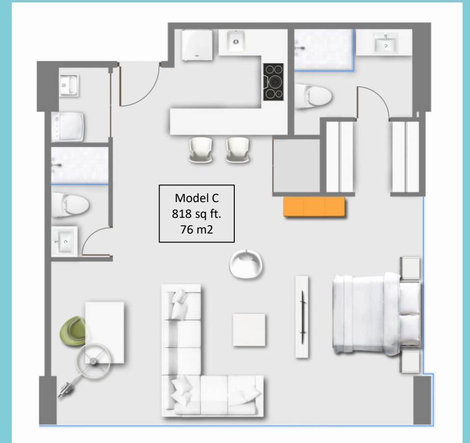
Apartments #1 and #2.