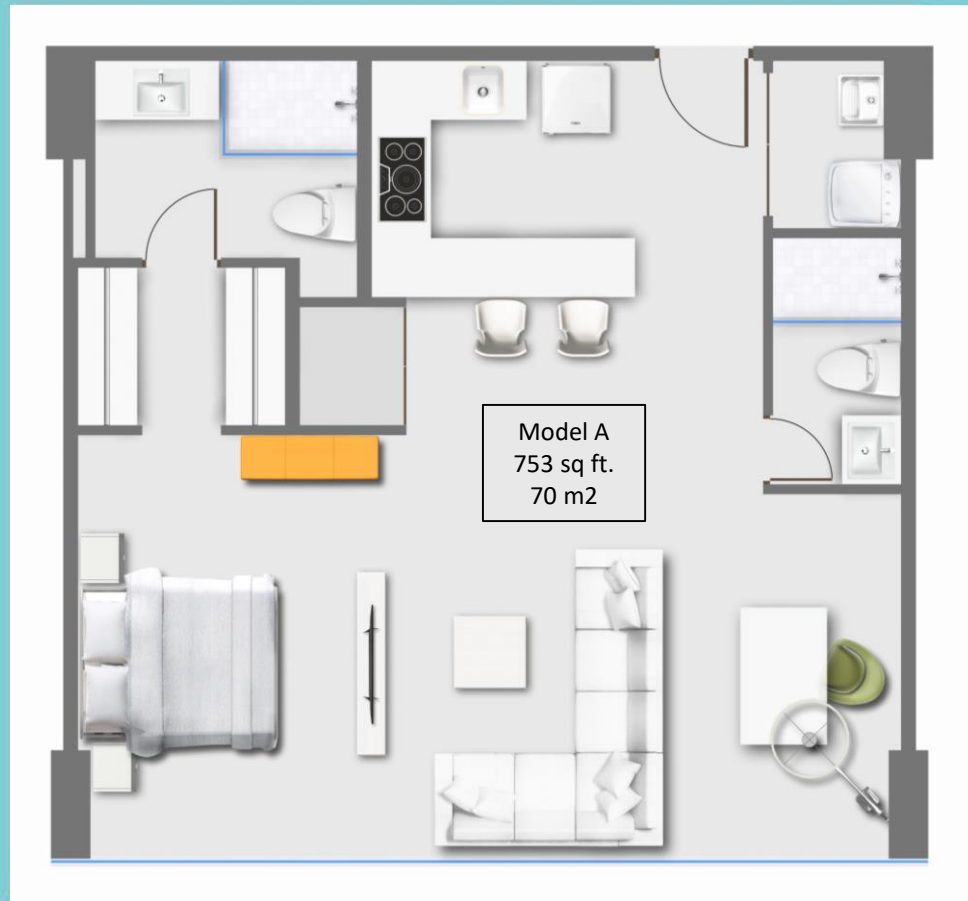
Apartments #3, #4, #5 and #8.